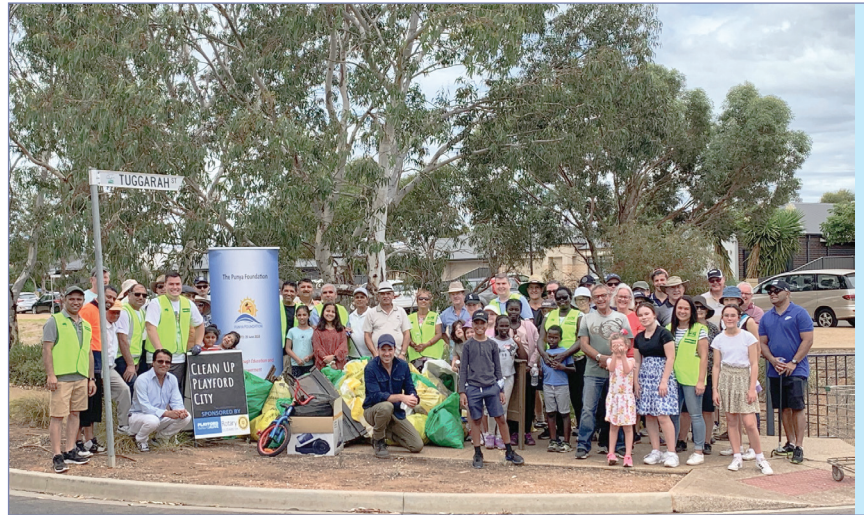
Punya Foundation's executives and volunteers, including children joined the clean-up program.