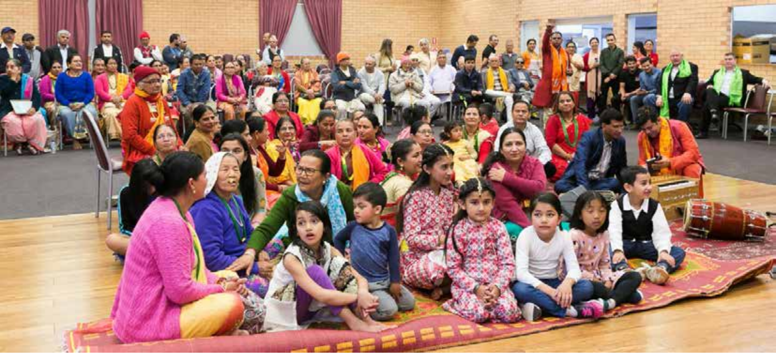
Participants at Multucultural Spiritual Program, Adelaide 2018