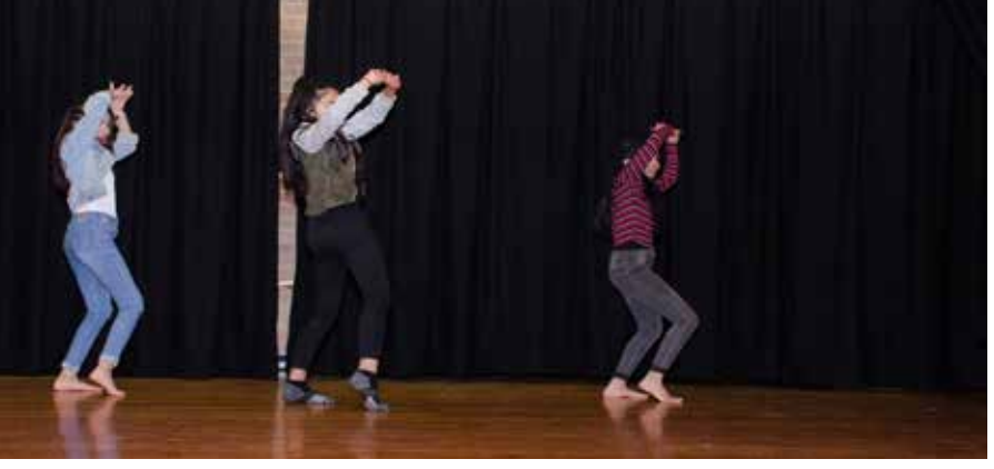
Artists perform during a community event in Sydney