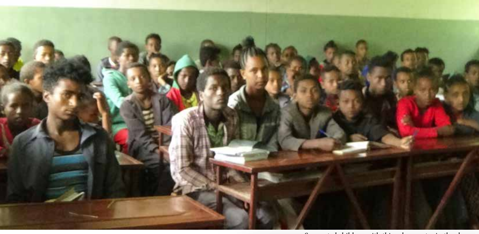
Supported children with thier class mates in the class