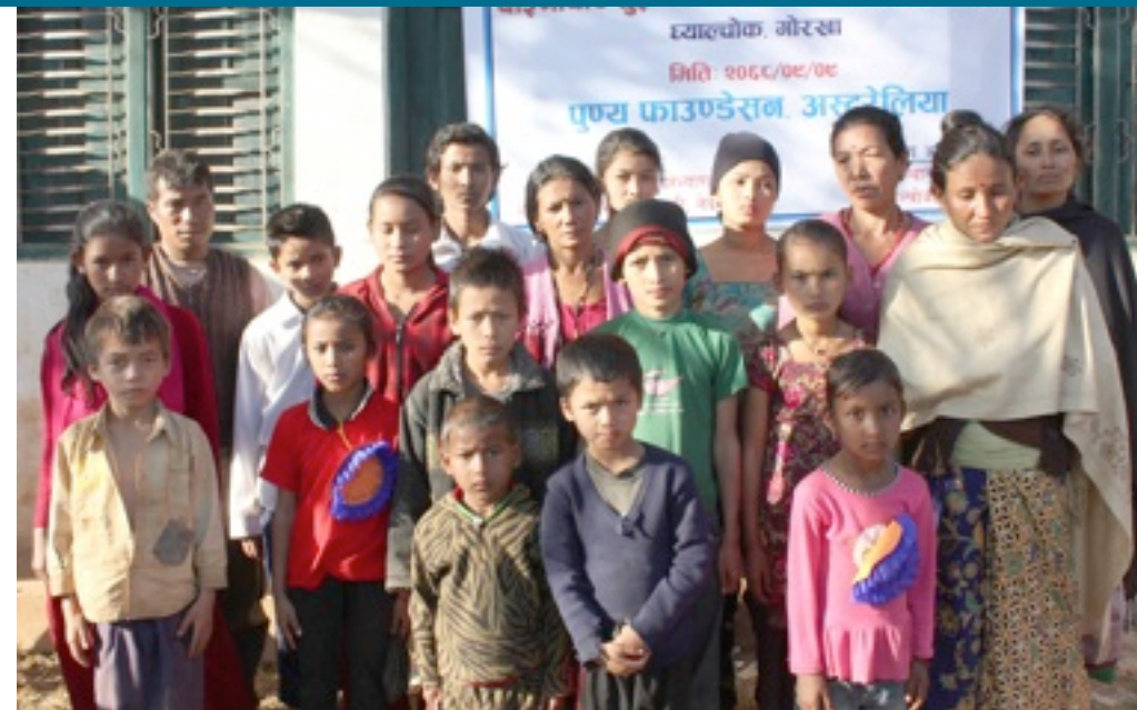
China Ghat tuin mishap victims pose for a group photo at Ghyalchok VDC, Gorkha: the day of relief package distribution.

Each of the seventeen students were distributed a sweater, a woolen cap, a pair of shoes, three pairs of socks and stationery to match the availability of items similar to the students studying in the grade.