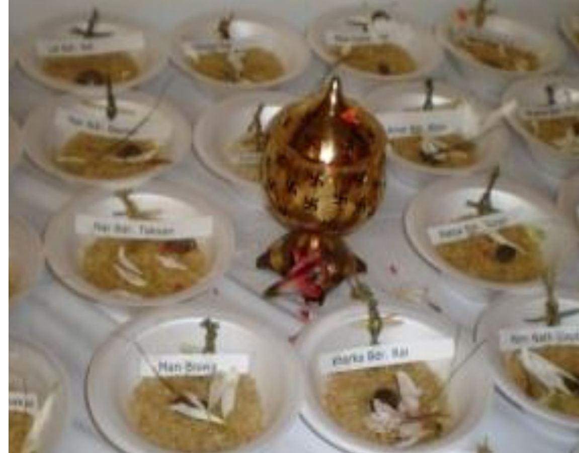
Hindu Salvation Program in Georgia of Atlanta (USA)