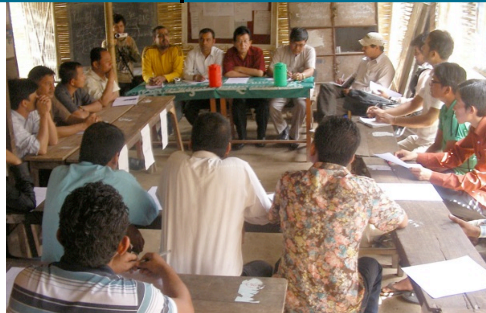
Various stakeholders and community members at a discussion program held to finalize the Foundation's scholarship program at Tri-Ratna Secondary School of Beldangi-II refugee camp.