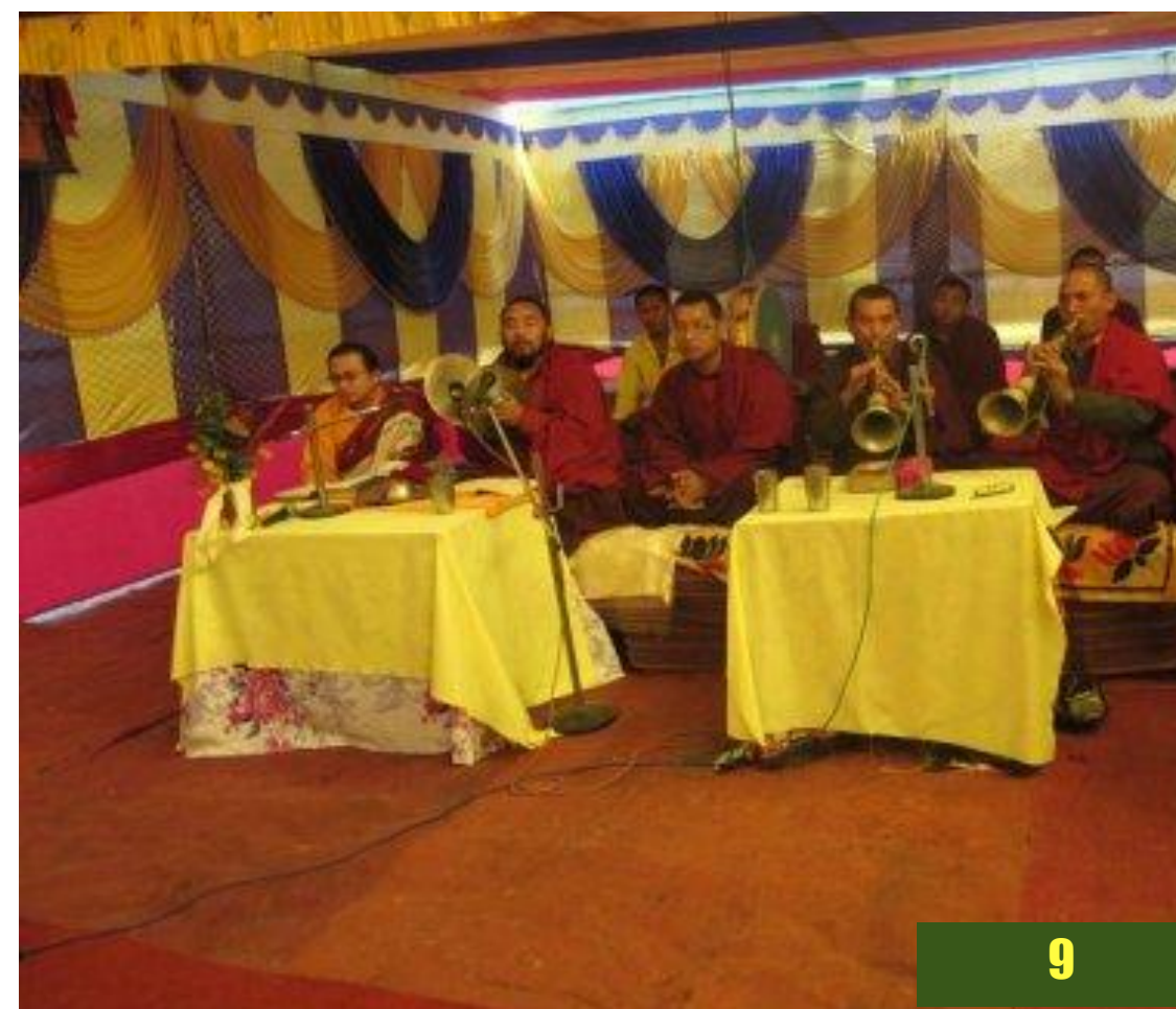
Buddhist monks performing salvation program in Beldangi-camp in Jhapa, Nepal