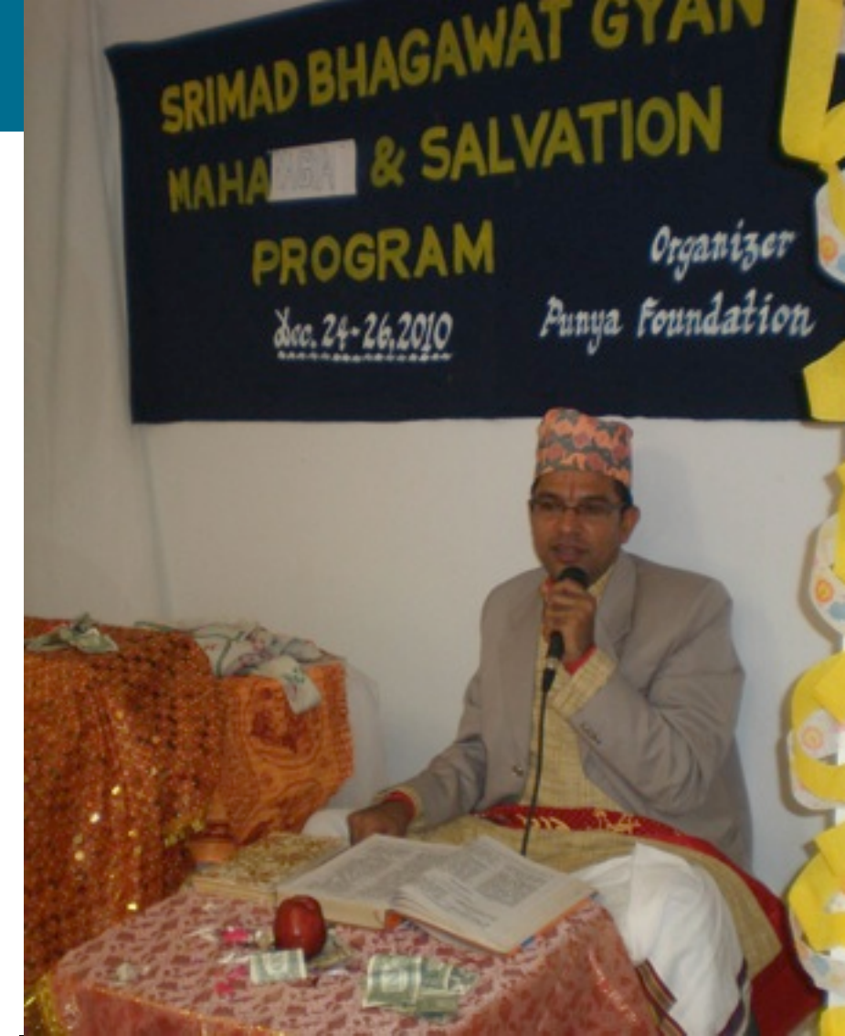
◆ Hindu salvation program highlights, Georgia, Atlanta (USA)